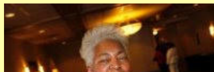
Special Collection and Community