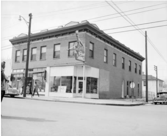
Equity Savings and Loan Association, c. 1950-1960.