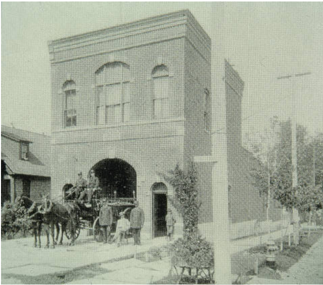
Hose Company #3, c. 1890.