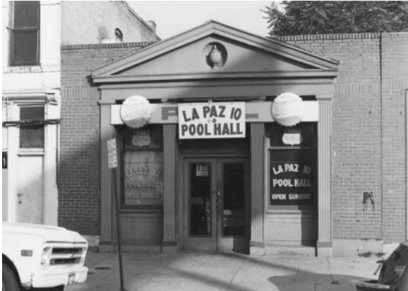
Douglass Undertaking Company, 1981.