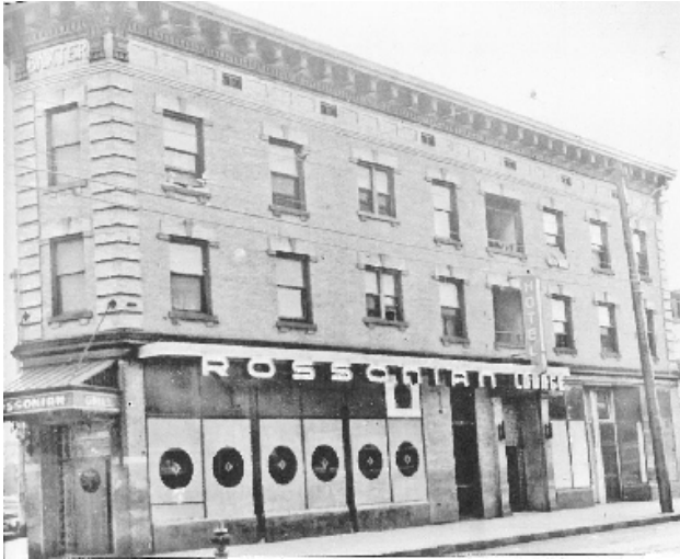
Rossonian Hotel, image date unknown. PLACE HOLDER UNTIL PHOTO REQUEST ARRIVES