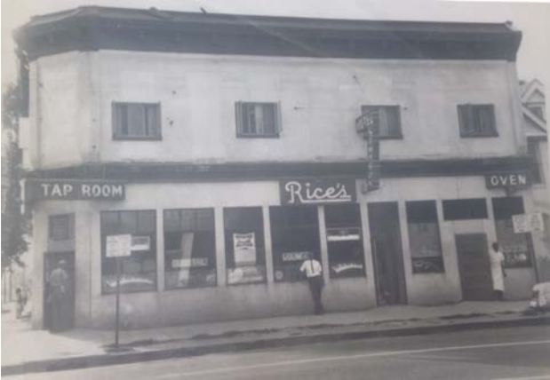
Rice's Tap Room and Oven, 1953. PLACE HOLDER UNTIL PHOTO REQUEST ARRIVES