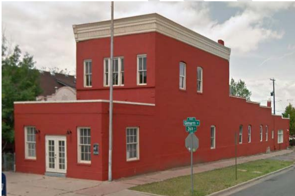
Hose Company #3, c. 2014 Google Image PLACE HOLDER until our photograph can be taken