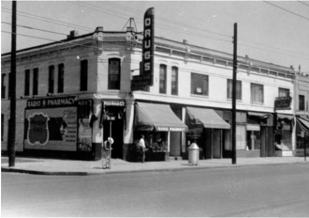
Radio Pharmacy, c. 1945-1955.