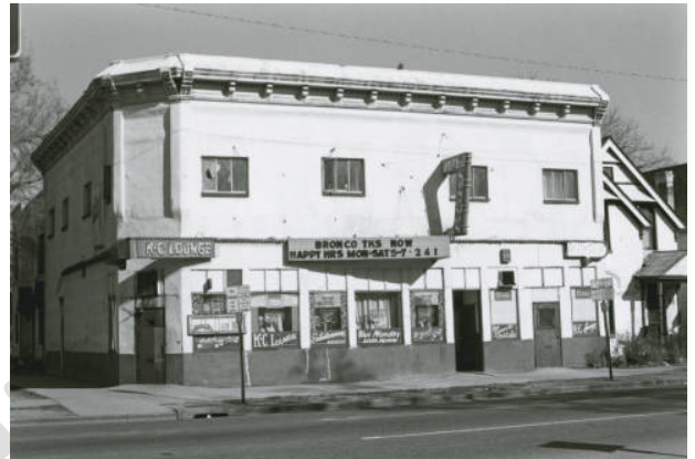
KC Lounge, c. 1978.