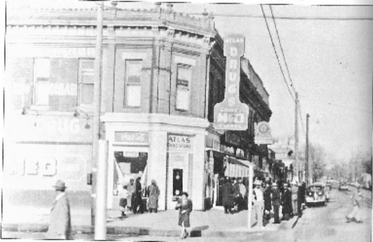
Atlas Drug, image date unknown. PLACE HOLDER UNTIL PHOTO REQUEST ARRIVES