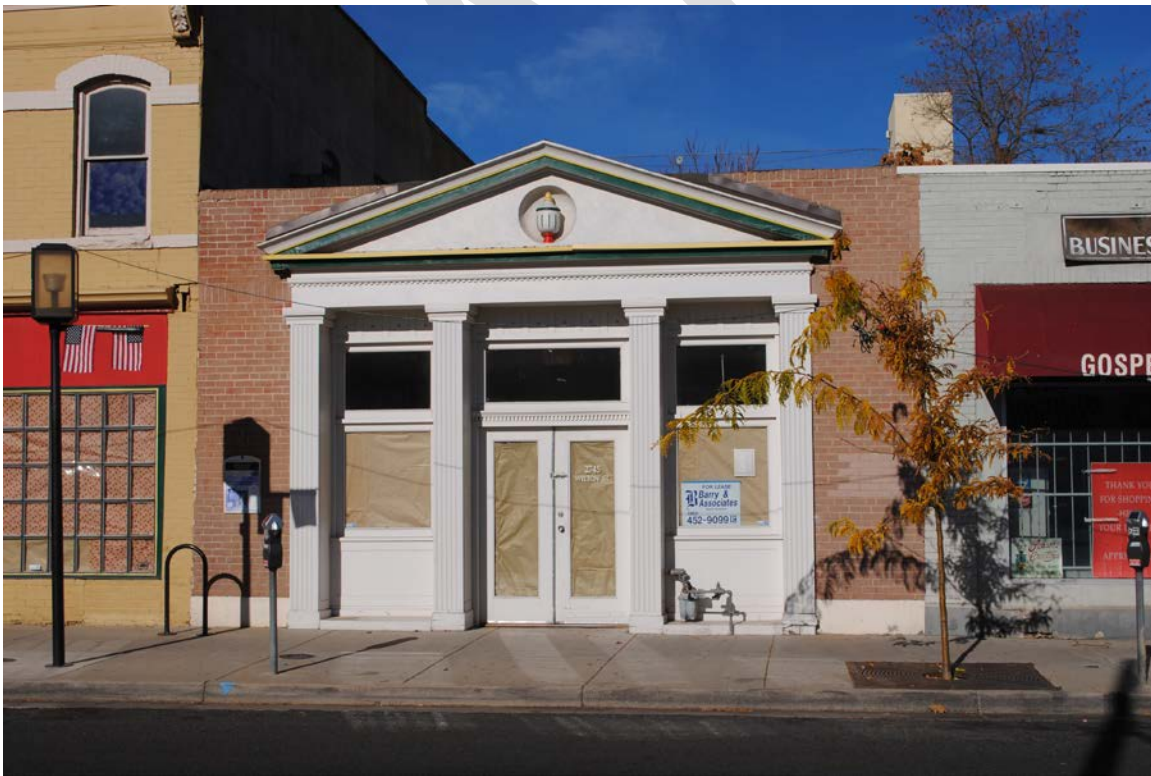
Douglass Undertaking Company, c. 2013.