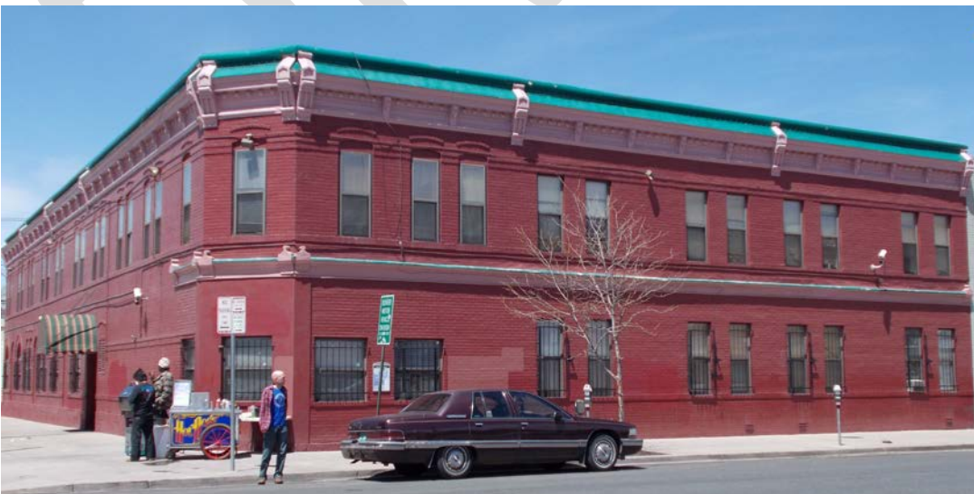
Radio Pharamcy, c. 2013.