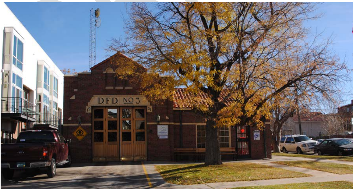
Fire Station #3, c. 2013