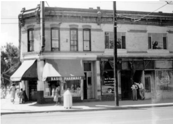
Radio Pharmacy, c. 1945-1955.