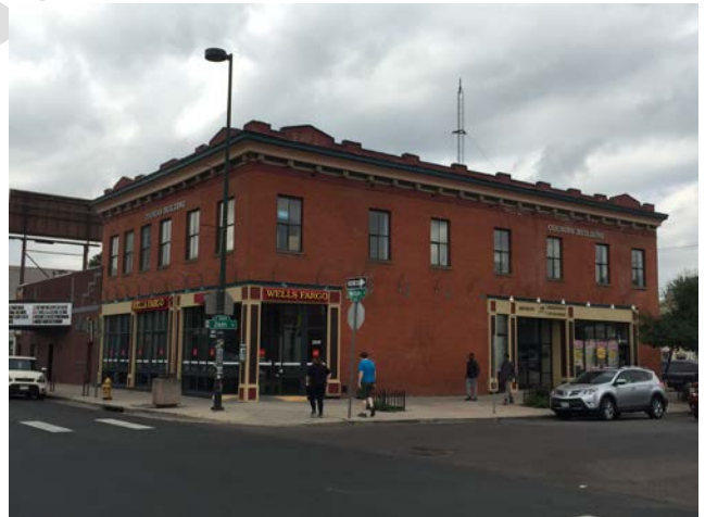
Current Images of Equity Savings and Loan, c. 2013-2014