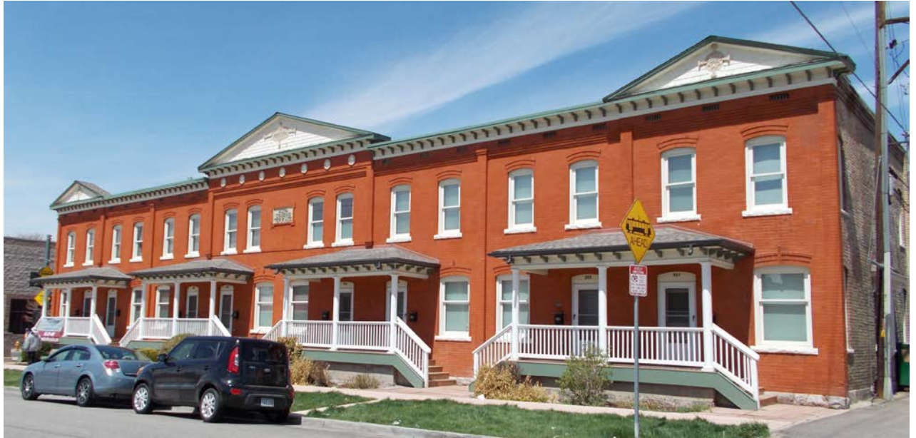
Atlas Cousin Terrace, c. 2013.