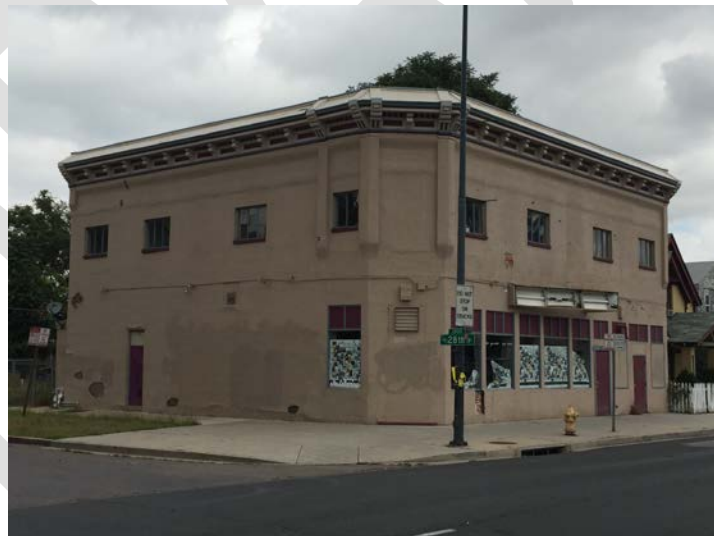
2801 Welton Street, c. 2014.