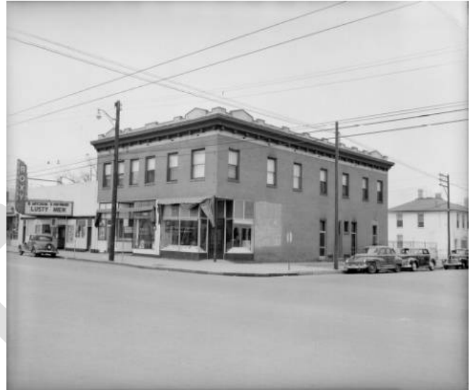
2559-2563 Welton Street, c. 1952.